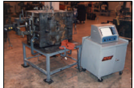
Assembled die set, 1 hr.