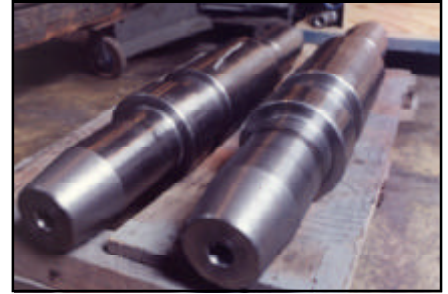
Hardened shafts, 8620, 45 min/set.