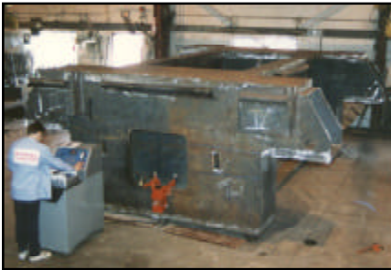
Heavy 80,000 lbs. press base 10 hrs.