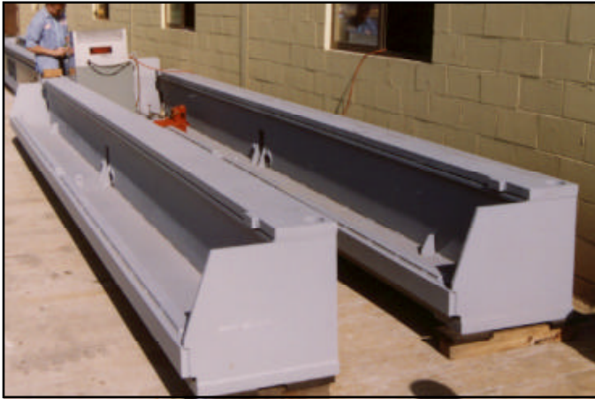
On-site service on weldments, 25-ft, 90 min/each.