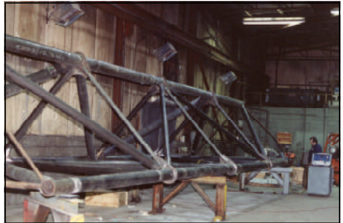
Large elevator support, 60-ft, 30,000 lbs., 12 hrs.